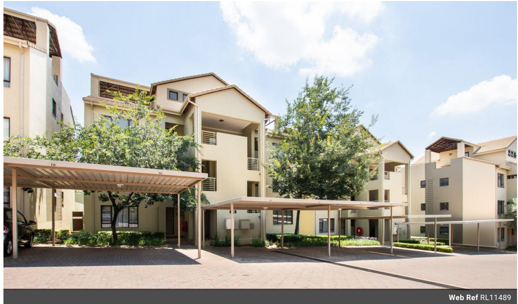
Web Ref RL11489

Loft Office 6 The Woodmill Lifestyle Centre Vredenburg Road Devonvallei Stellenbosch 7600