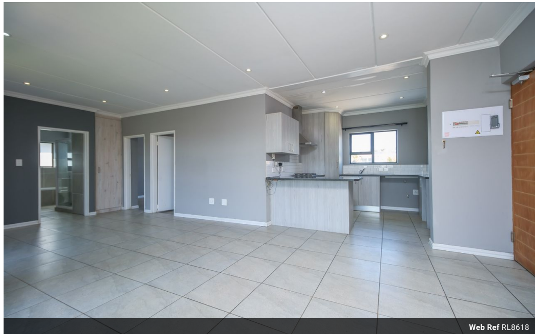
Web Ref RL8618

Loft Office 6 The Woodmill Lifestyle Centre Vredenburg Road Devonvallei Stellenbosch 7600