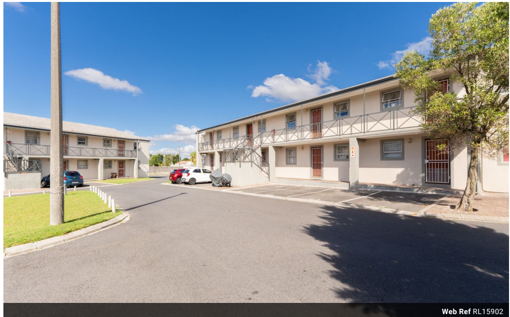
Web Ref RL15902

Loft Office 6 The Woodmill Lifestyle Centre Vredenburg Road Devonvallei Stellenbosch 7600