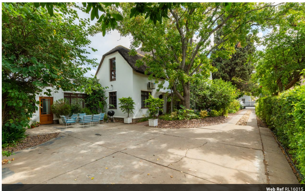
Web Ref RL16015

Loft Office 6 The Woodmill Lifestyle Centre Vredenburg Road Devonvallei Stellenbosch 7600