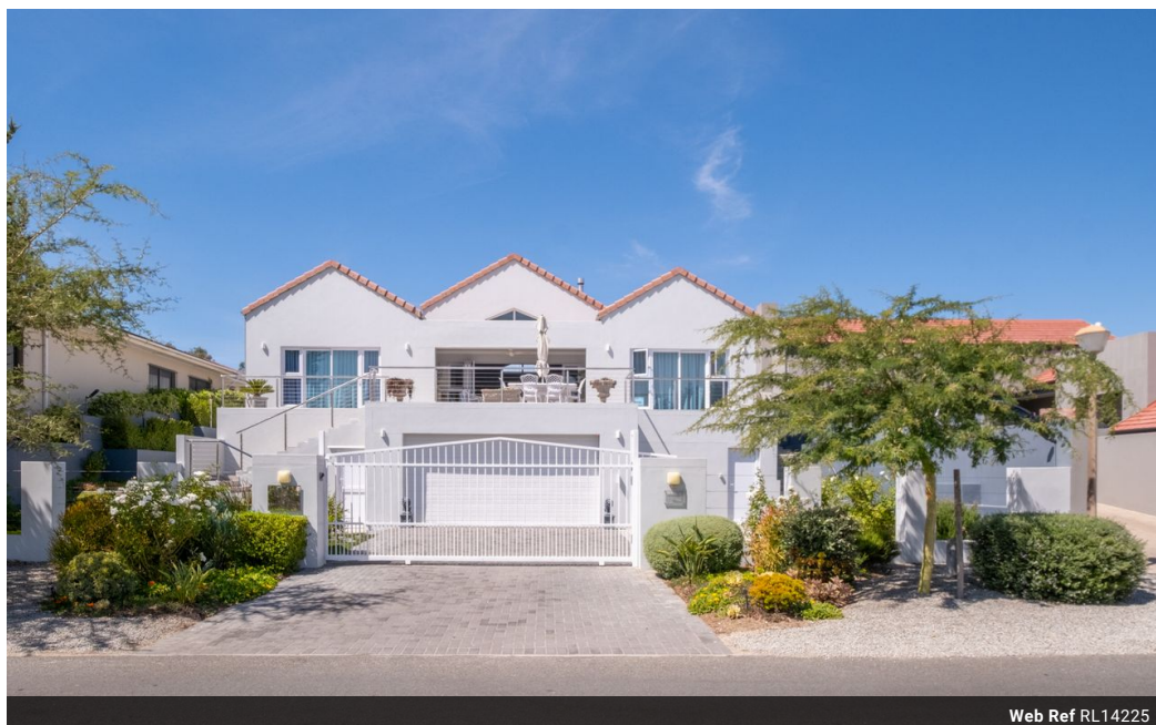
Web Ref RL14225

Loft Office 6 The Woodmill Lifestyle Centre Vredenburg Road Devonvallei Stellenbosch 7600