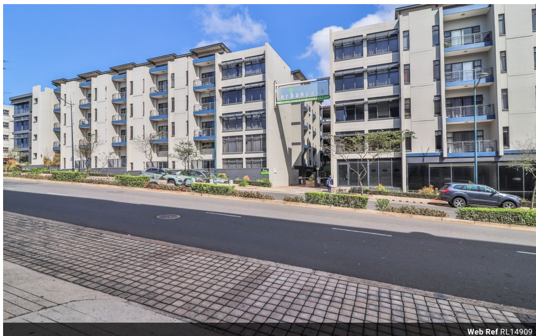
Web Ref RL14909

Loft Office 6 The Woodmill Lifestyle Centre Vredenburg Road Devonvallei Stellenbosch 7600