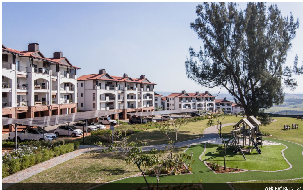
Web Ref RL15157

Loft Office 6 The Woodmill Lifestyle Centre Vredenburg Road Devonvallei Stellenbosch 7600