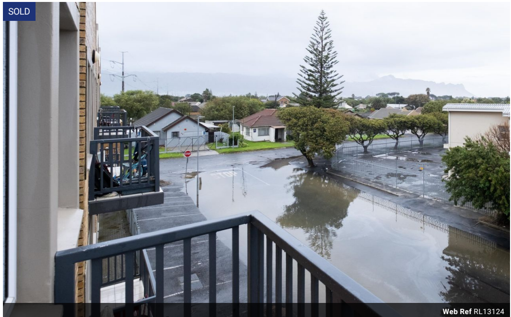
Web Ref RL13124

Loft Office 6 The Woodmill Lifestyle Centre Vredenburg Road Devonvallei Stellenbosch 7600