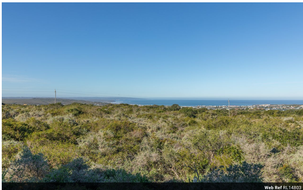
Web Ref RL14803

Loft Office 6 The Woodmill Lifestyle Centre Vredenburg Road Devonvallei Stellenbosch 7600