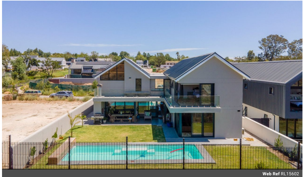
Web Ref RL15602

Loft Office 6 The Woodmill Lifestyle Centre Vredenburg Road Devonvallei Stellenbosch 7600