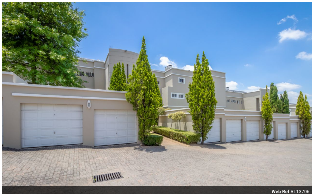
Web Ref RL13706

Loft Office 6 The Woodmill Lifestyle Centre Vredenburg Road Devonvallei Stellenbosch 7600