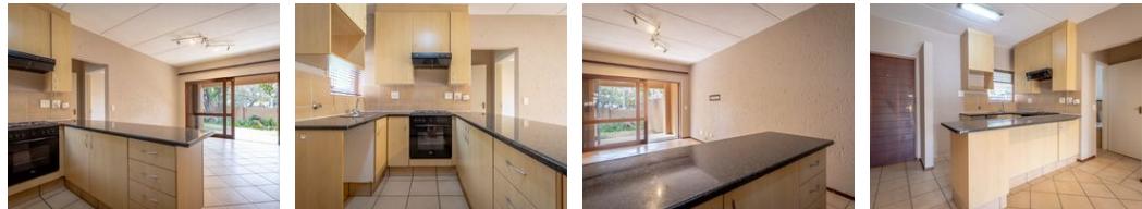
Web Ref RL15920