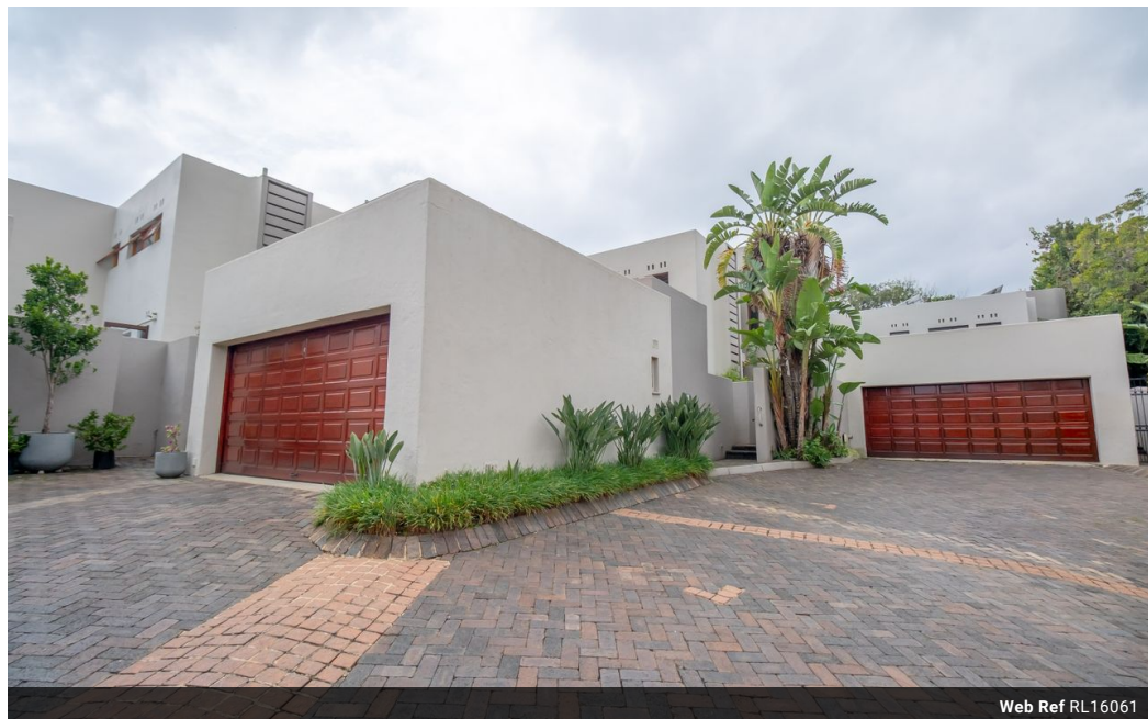
Web Ref RL16061

Loft Office 6 The Woodmill Lifestyle Centre Vredenburg Road Devonvallei Stellenbosch 7600