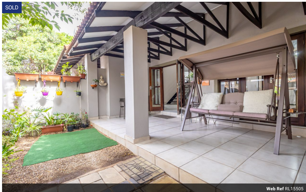
Web Ref RL15505

Loft Office 6 The Woodmill Lifestyle Centre Vredenburg Road Devonvallei Stellenbosch 7600