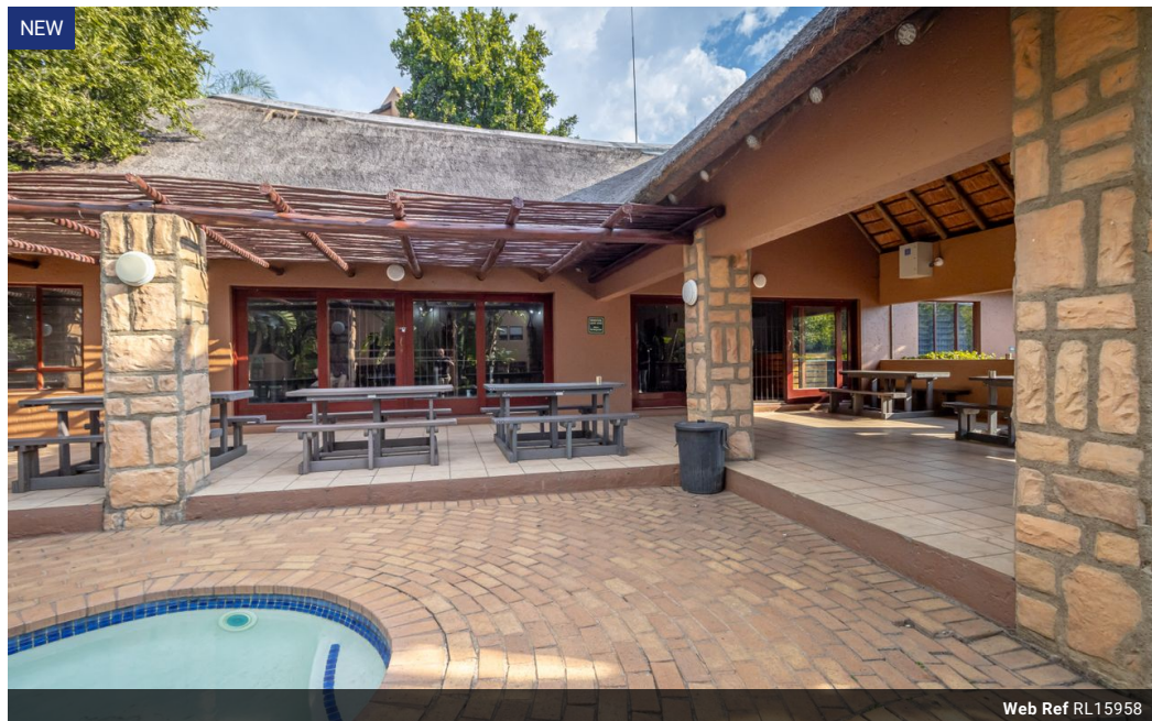
Web Ref RL15958

Loft Office 6 The Woodmill Lifestyle Centre Vredenburg Road Devonvallei Stellenbosch 7600