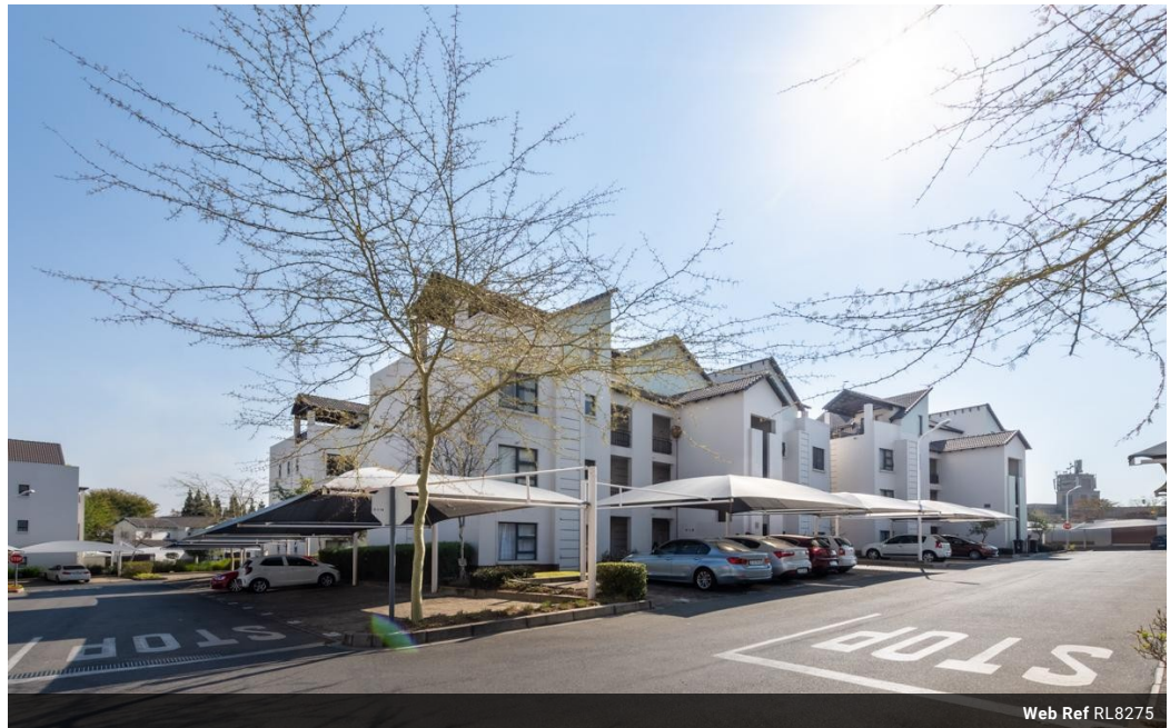
Web Ref RL8275

Loft Office 6 The Woodmill Lifestyle Centre Vredenburg Road Devonvallei Stellenbosch 7600