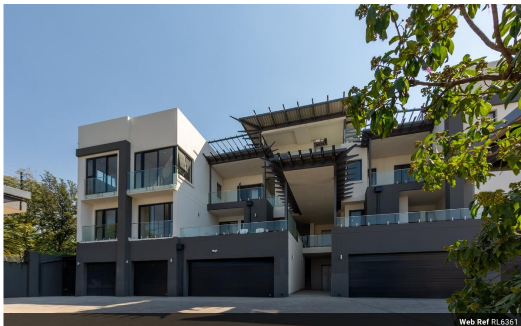
Web Ref RL6361

Loft Office 6 The Woodmill Lifestyle Centre Vredenburg Road Devonvallei Stellenbosch 7600