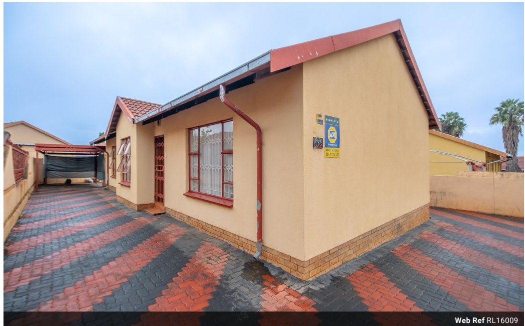
Web Ref RL16009

Loft Office 6 The Woodmill Lifestyle Centre Vredenburg Road Devonvallei Stellenbosch 7600