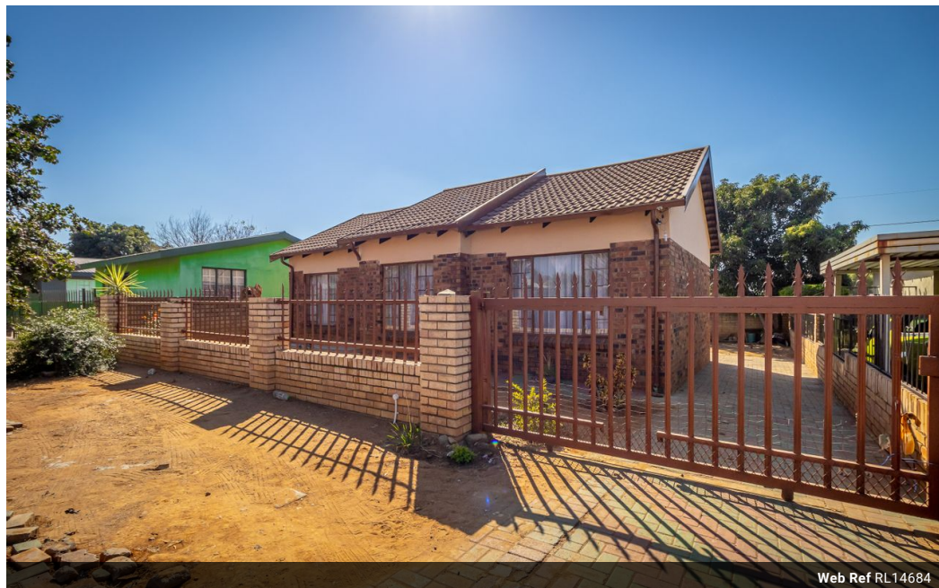
Web Ref RL14684

Loft Office 6 The Woodmill Lifestyle Centre Vredenburg Road Devonvallei Stellenbosch 7600