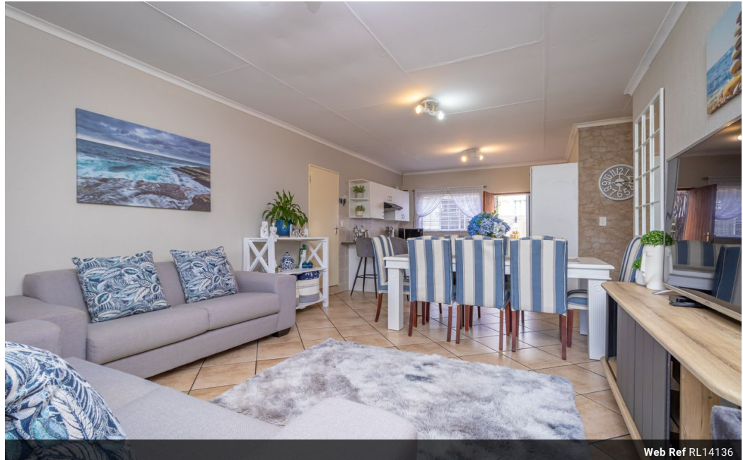
Web Ref RL14136

Loft Office 6 The Woodmill Lifestyle Centre Vredenburg Road Devonvallei Stellenbosch 7600