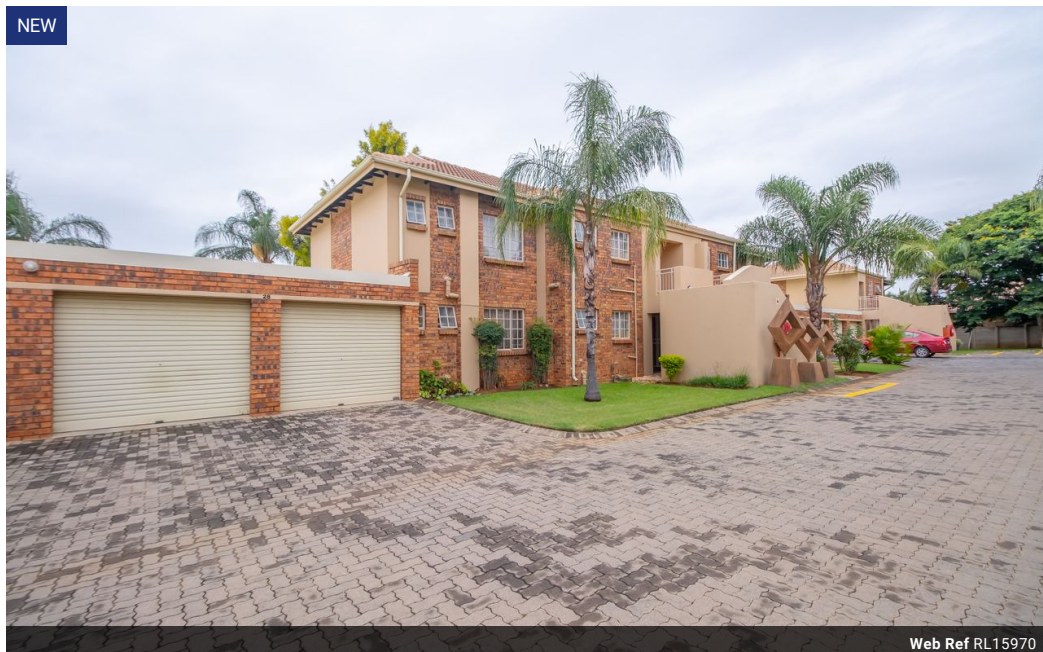
Web Ref RL15970

Loft Office 6 The Woodmill Lifestyle Centre Vredenburg Road Devonvallei Stellenbosch 7600