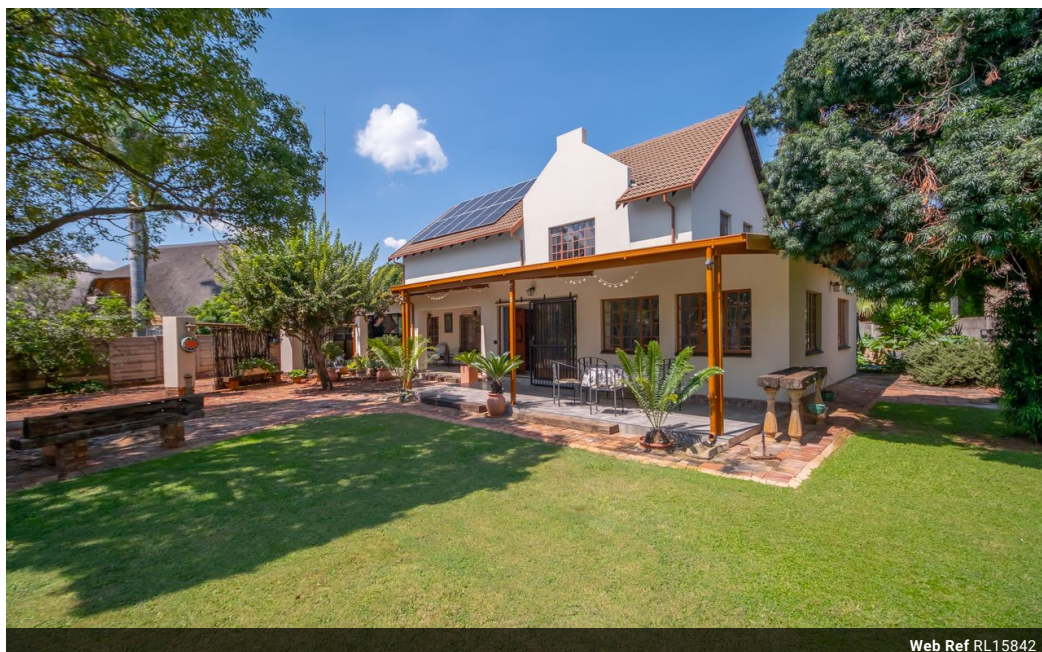
Web Ref RL15842

Loft Office 6 The Woodmill Lifestyle Centre Vredenburg Road Devonvallei Stellenbosch 7600