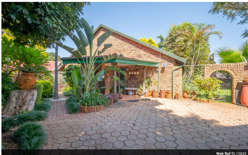
Web Ref RL15843

Loft Office 6 The Woodmill Lifestyle Centre Vredenburg Road Devonvallei Stellenbosch 7600