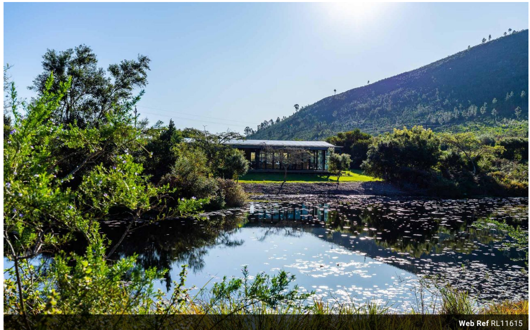
Web Ref RL11615

Loft Office 6 The Woodmill Lifestyle Centre Vredenburg Road Devonvallei Stellenbosch 7600