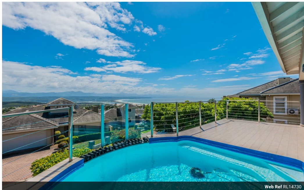
Web Ref RL14730

Loft Office 6 The Woodmill Lifestyle Centre Vredenburg Road Devonvallei Stellenbosch 7600