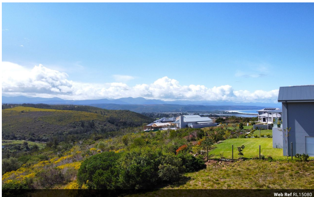
Web Ref RL15080

Loft Office 6 The Woodmill Lifestyle Centre Vredenburg Road Devonvallei Stellenbosch 7600