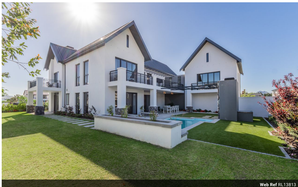
Web Ref RL13813

Loft Office 6 The Woodmill Lifestyle Centre Vredenburg Road Devonvallei Stellenbosch 7600