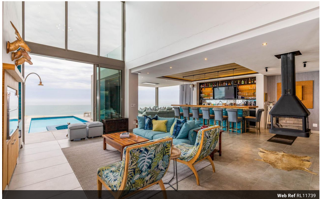
Web Ref RL11739

Loft Office 6 The Woodmill Lifestyle Centre Vredenburg Road Devonvallei Stellenbosch 7600