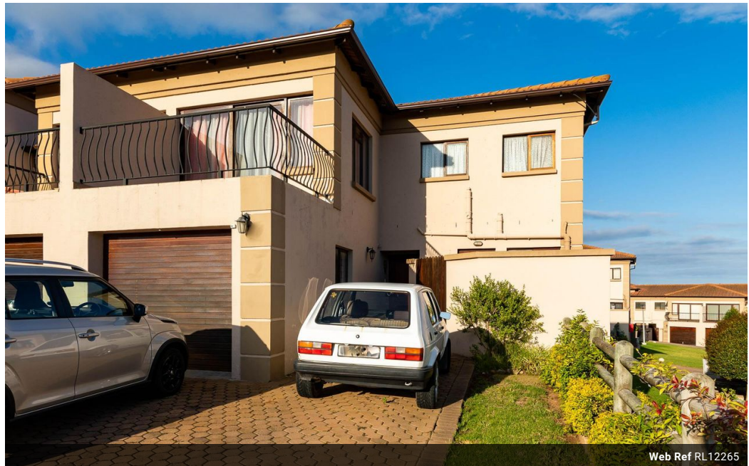
Web Ref RL12265

Loft Office 6 The Woodmill Lifestyle Centre Vredenburg Road Devonvallei Stellenbosch 7600