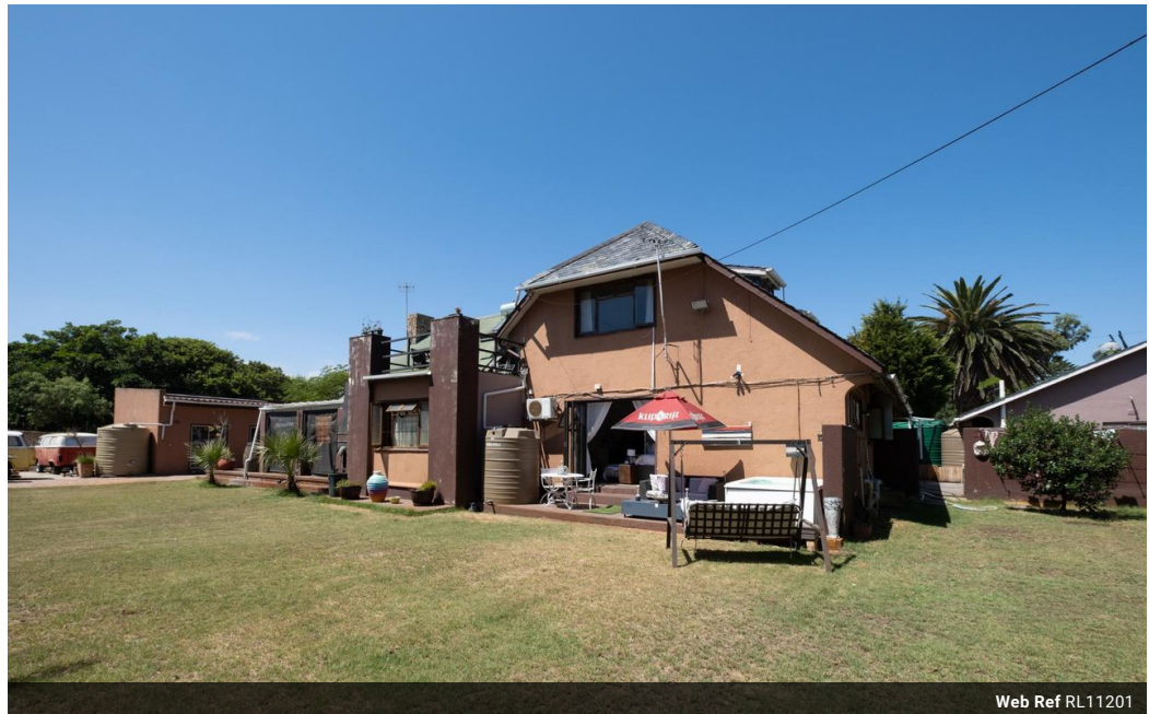
Web Ref RL11201

Loft Office 6 The Woodmill Lifestyle Centre Vredenburg Road Devonvallei Stellenbosch 7600