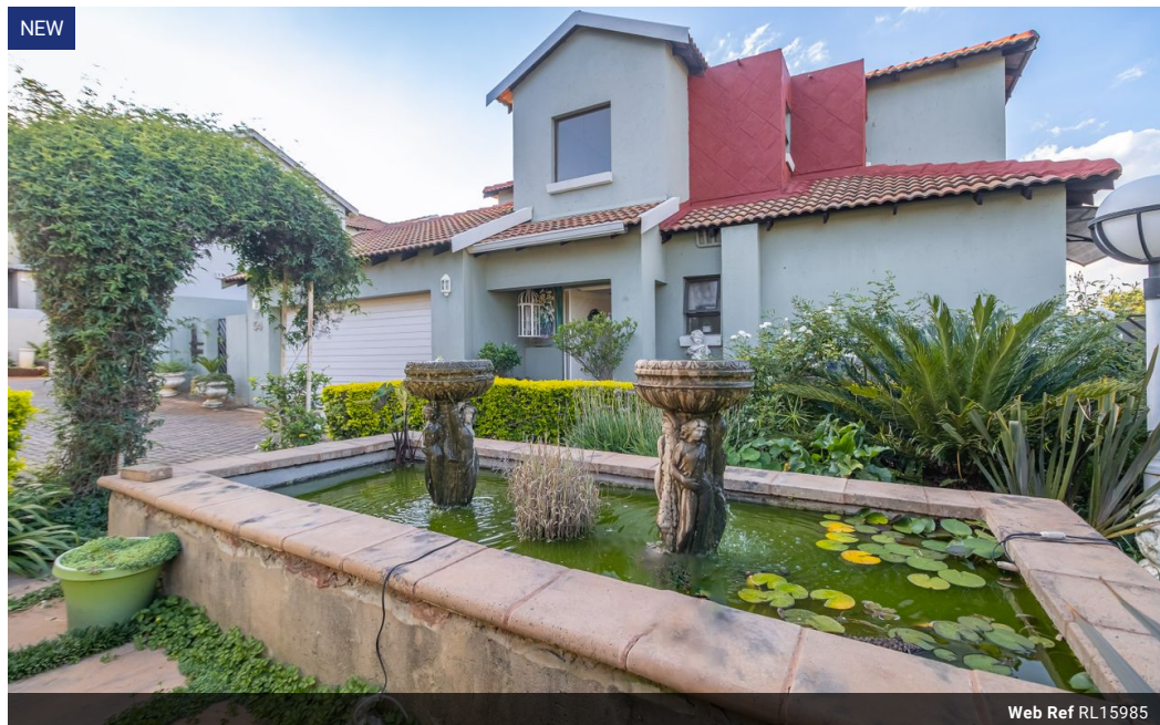
Web Ref RL15985

Loft Office 6 The Woodmill Lifestyle Centre Vredenburg Road Devonvallei Stellenbosch 7600