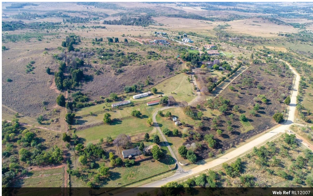
Web Ref RL12007

Loft Office 6 The Woodmill Lifestyle Centre Vredenburg Road Devonvallei Stellenbosch 7600