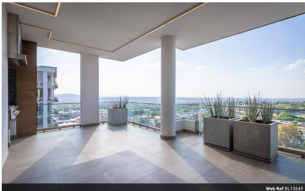
Web Ref RL12645

Loft Office 6 The Woodmill Lifestyle Centre Vredenburg Road Devonvallei Stellenbosch 7600