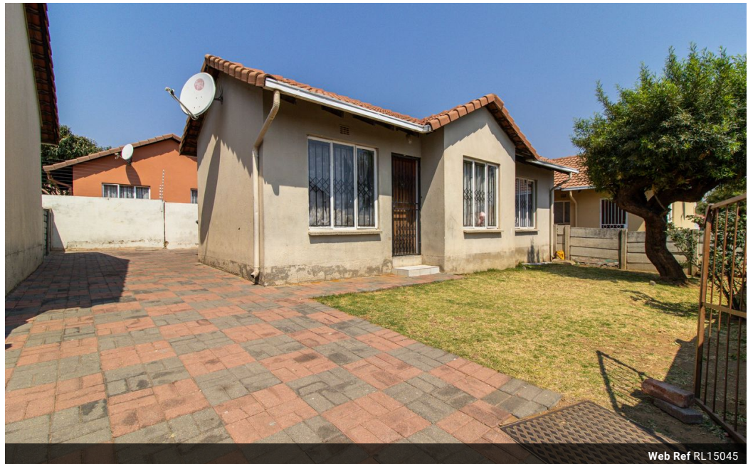
Web Ref RL15045

Loft Office 6 The Woodmill Lifestyle Centre Vredenburg Road Devonvallei Stellenbosch 7600