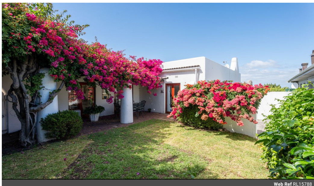
Web Ref RL15788

Loft Office 6 The Woodmill Lifestyle Centre Vredenburg Road Devonvallei Stellenbosch 7600