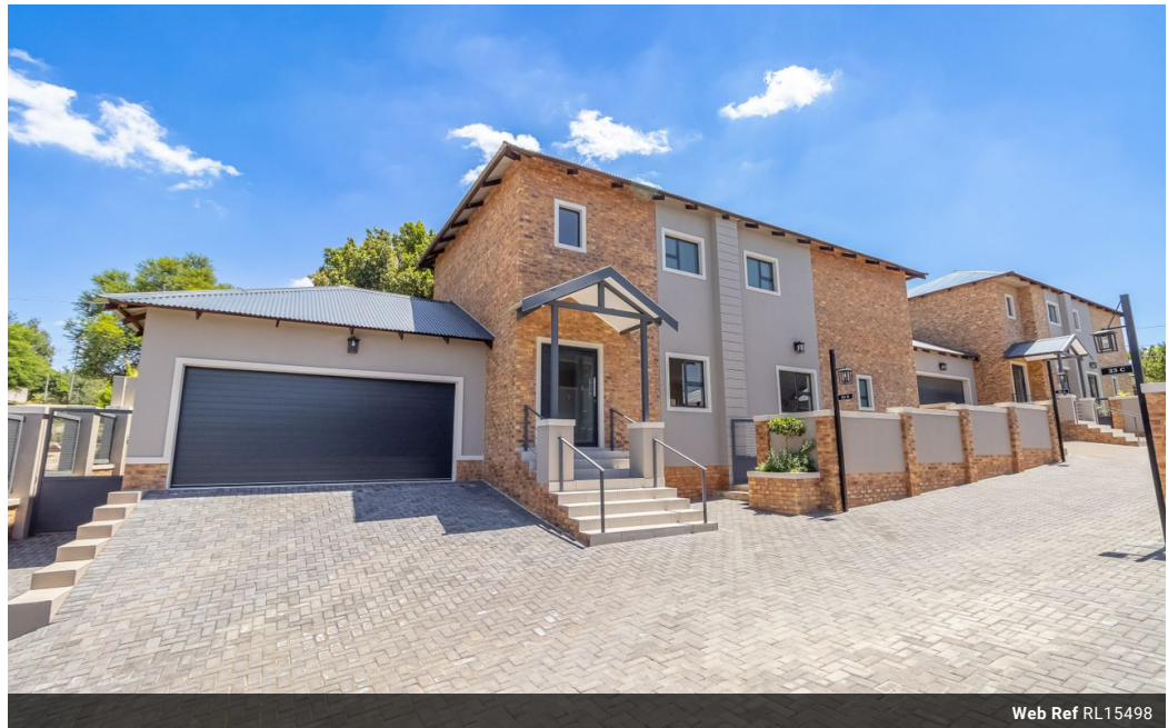
Web Ref RL15498

Loft Office 6 The Woodmill Lifestyle Centre Vredenburg Road Devonvallei Stellenbosch 7600