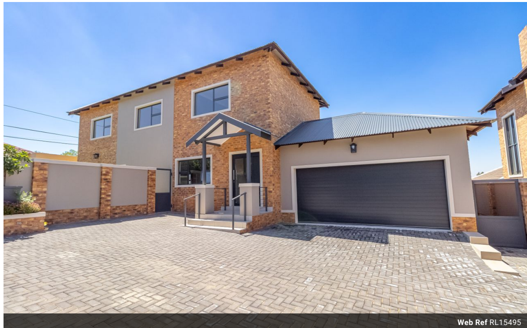
Web Ref RL15495

Loft Office 6 The Woodmill Lifestyle Centre Vredenburg Road Devonvallei Stellenbosch 7600