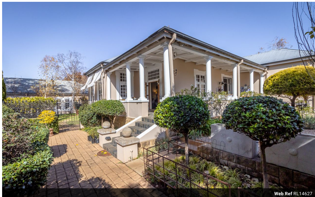
Web Ref RL14627

Loft Office 6 The Woodmill Lifestyle Centre Vredenburg Road Devonvallei Stellenbosch 7600