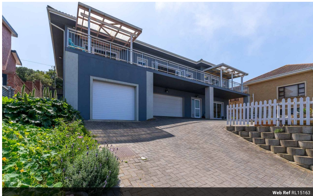
Web Ref RL15163

Loft Office 6 The Woodmill Lifestyle Centre Vredenburg Road Devonvallei Stellenbosch 7600