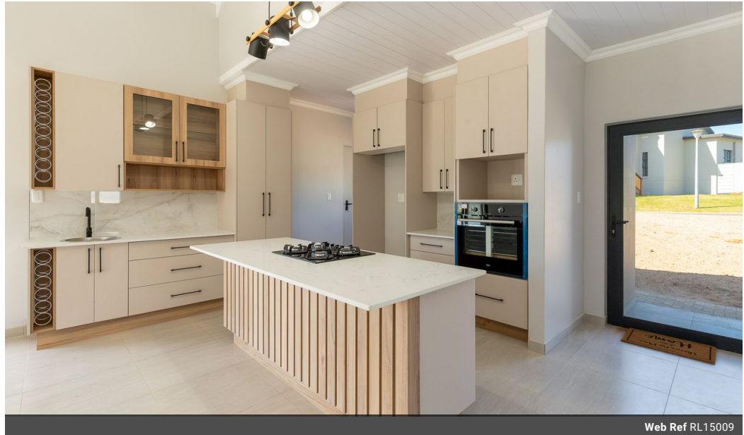
Web Ref RL15009

Loft Office 6 The Woodmill Lifestyle Centre Vredenburg Road Devonvallei Stellenbosch 7600