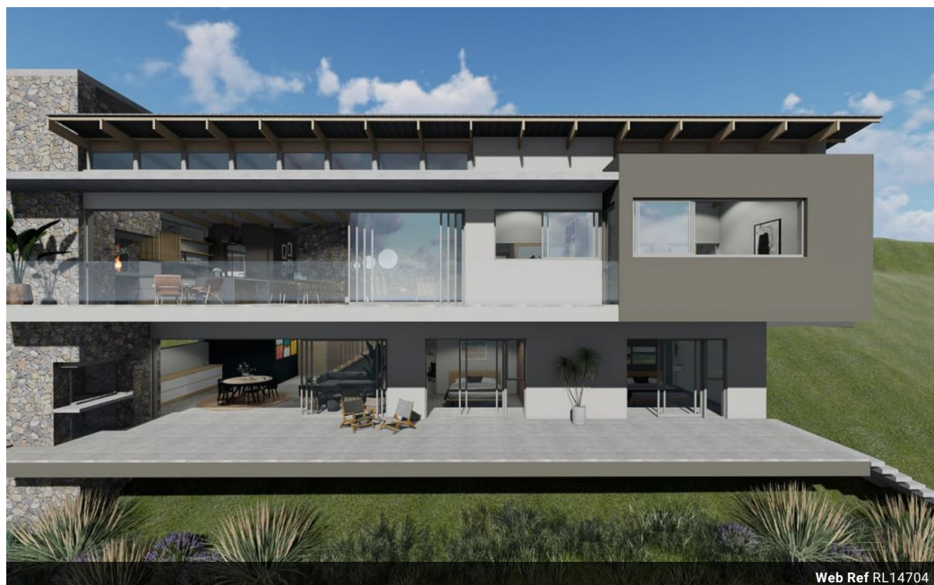
Web Ref RL14704

Loft Office 6 The Woodmill Lifestyle Centre Vredenburg Road Devonvallei Stellenbosch 7600