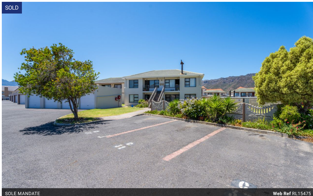
SOLE MANDATE Web Ref RL15475

Loft Office 6 The Woodmill Lifestyle Centre Vredenburg Road Devonvallei Stellenbosch 7600