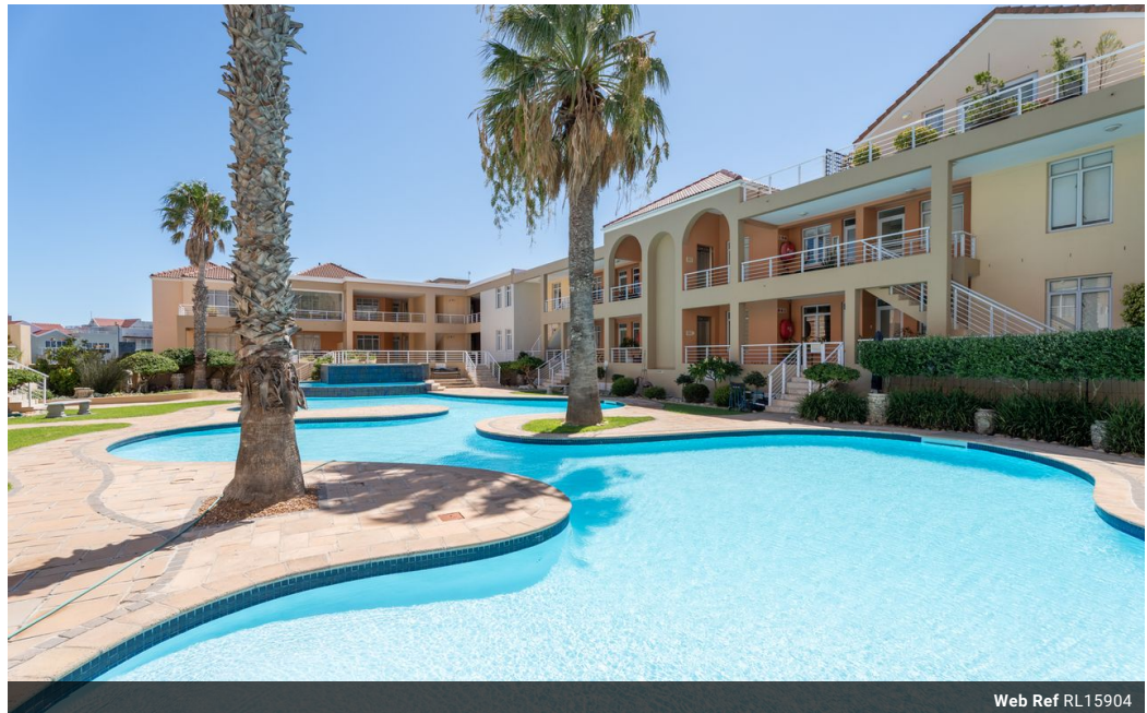
Web Ref RL15904

Loft Office 6 The Woodmill Lifestyle Centre Vredenburg Road Devonvallei Stellenbosch 7600