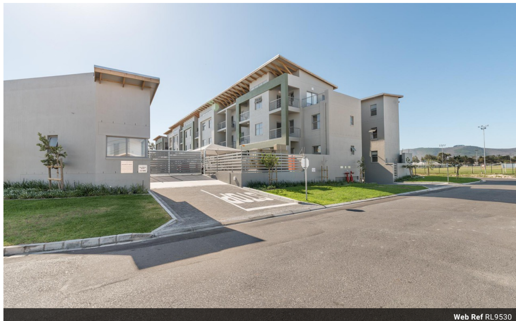
Web Ref RL9530

Loft Office 6 The Woodmill Lifestyle Centre Vredenburg Road Devonvallei Stellenbosch 7600