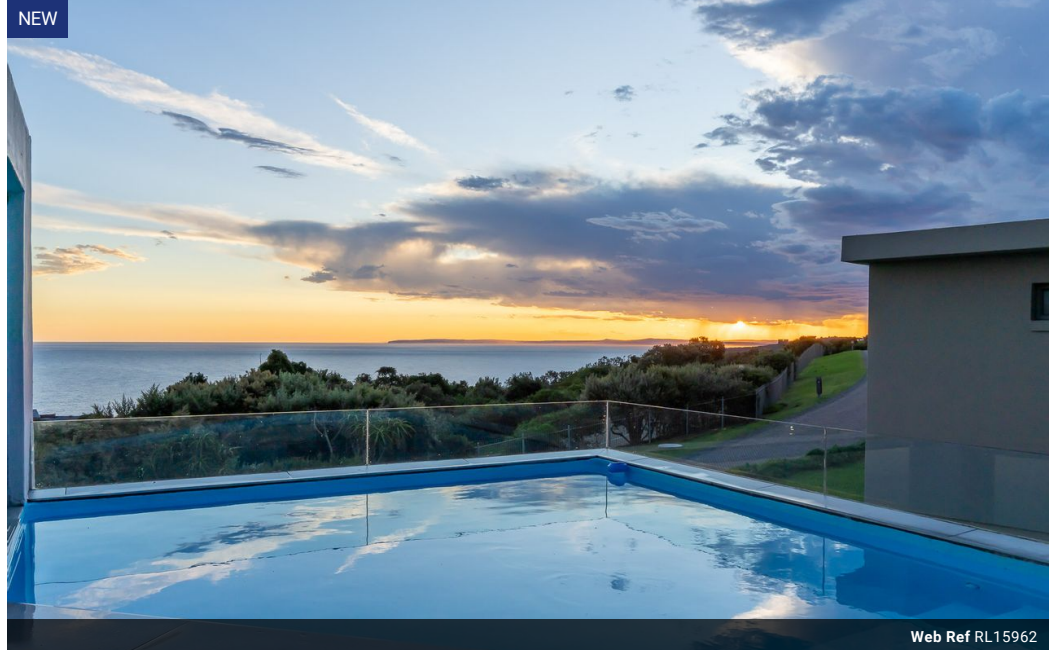
Web Ref RL15962

Loft Office 6 The Woodmill Lifestyle Centre Vredenburg Road Devonvallei Stellenbosch 7600