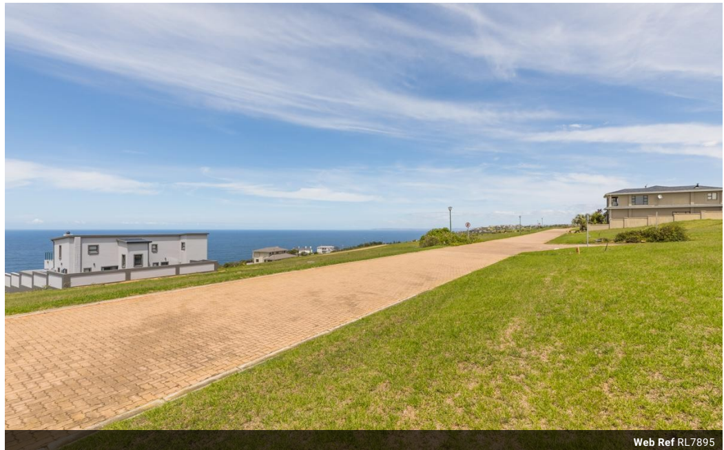
Web Ref RL7895

Loft Office 6 The Woodmill Lifestyle Centre Vredenburg Road Devonvallei Stellenbosch 7600