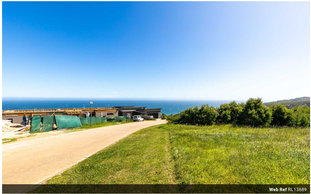
Web Ref RL13689

Loft Office 6 The Woodmill Lifestyle Centre Vredenburg Road Devonvallei Stellenbosch 7600