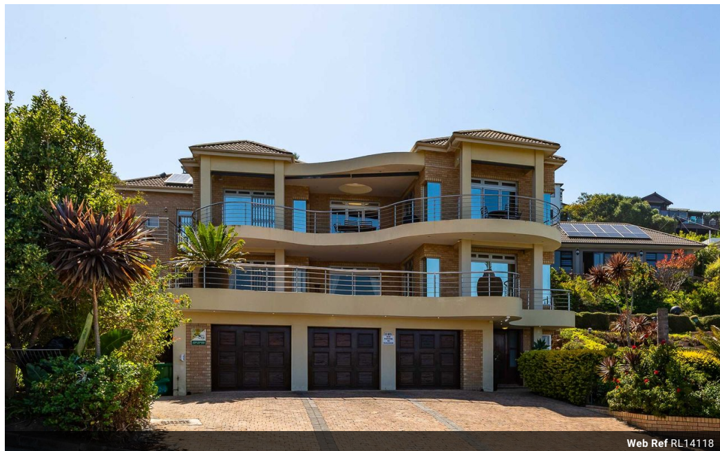
Web Ref RL14118

Loft Office 6 The Woodmill Lifestyle Centre Vredenburg Road Devonvallei Stellenbosch 7600