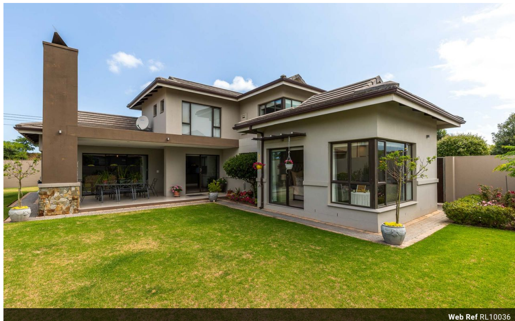
Web Ref RL10036

Loft Office 6 The Woodmill Lifestyle Centre Vredenburg Road Devonvallei Stellenbosch 7600