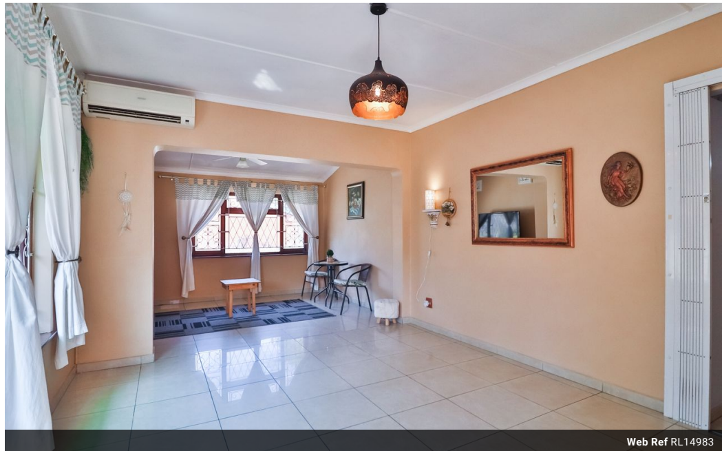
Web Ref RL14983

Loft Office 6 The Woodmill Lifestyle Centre Vredenburg Road Devonvallei Stellenbosch 7600